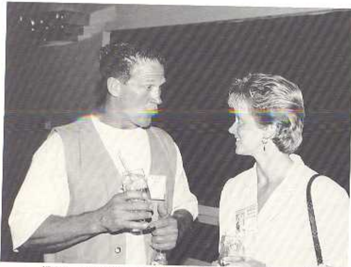
"No, honest! Kirtland Warblers breed primarily in Michigan."