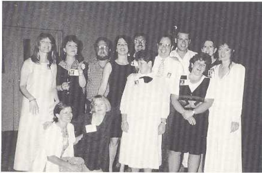
The Birchgrove Neighborhood Gang