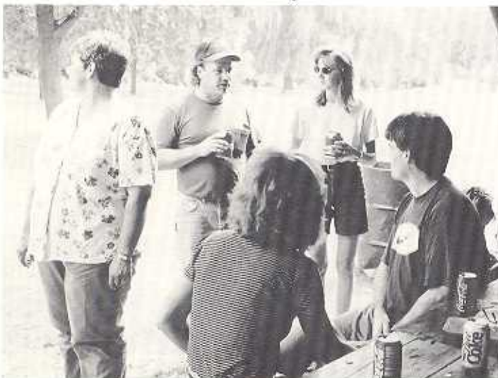
Chris Pozniak, The Smiths and Dave Braman