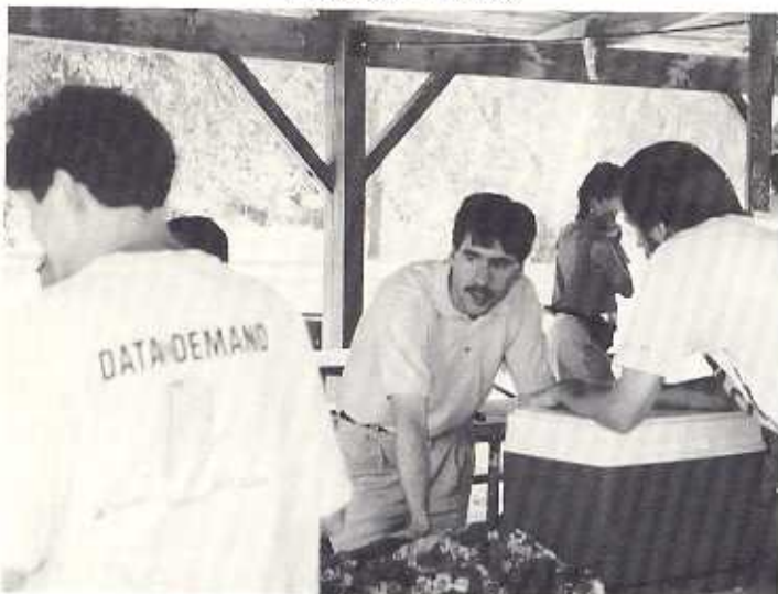
"I studied cryogenics once ..."