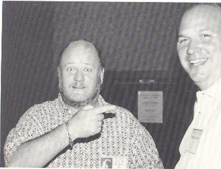
"Isn't he a year late?"