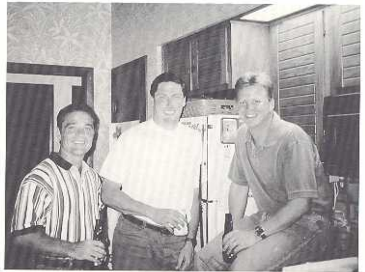
Friday night at Fred's