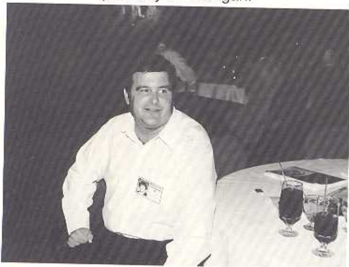
"Boy, that Deb is still a babe!"