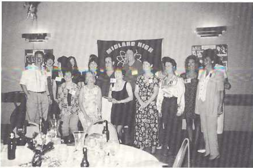
Chestnut Hill Crew