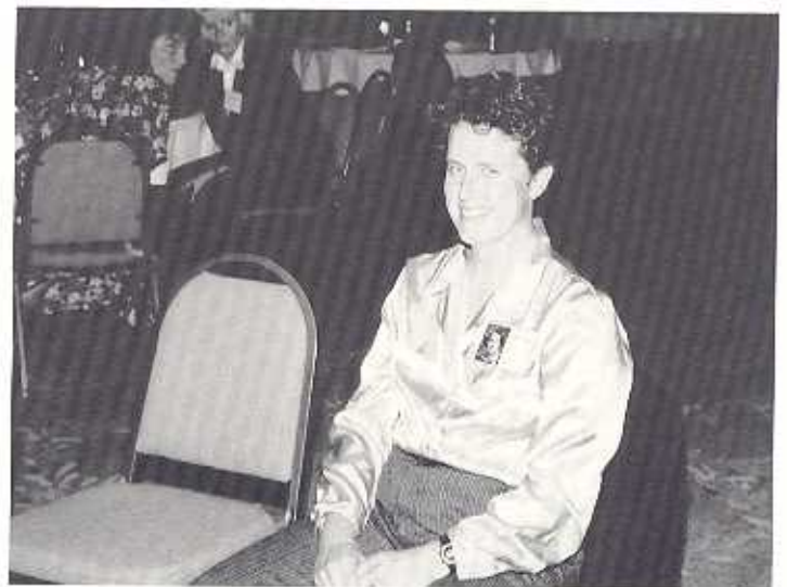
"Is it something I said?"