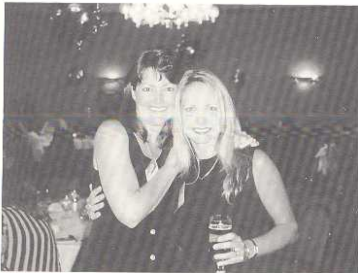
"We're having a blast!"