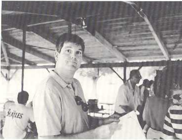
"Am I in the right place?"