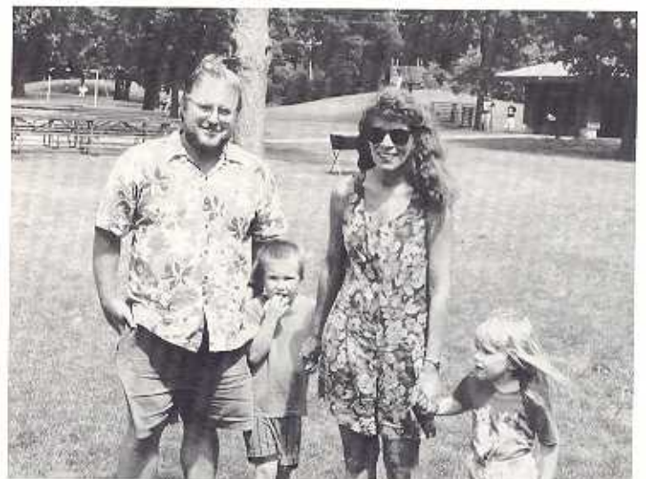
The Leahy Clan