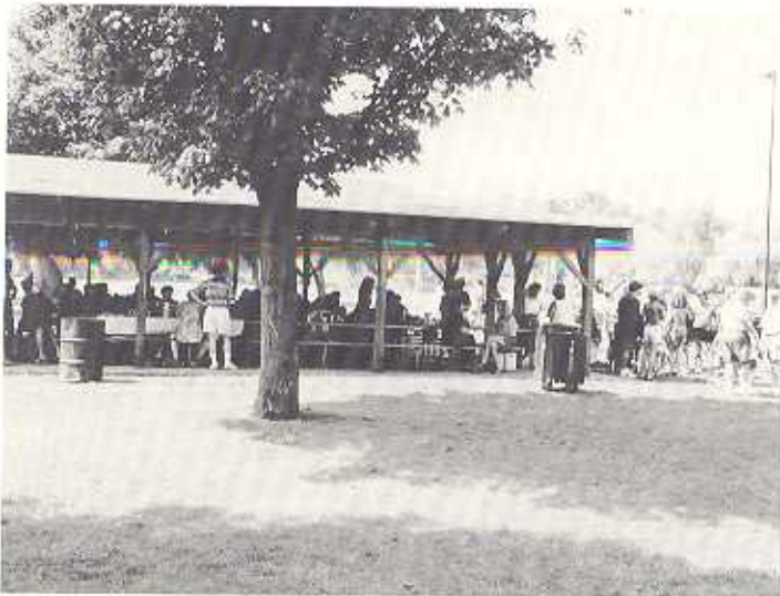
Fun in the sun Emerson Park