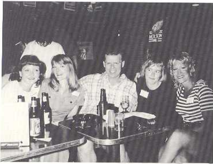
Let the party begin